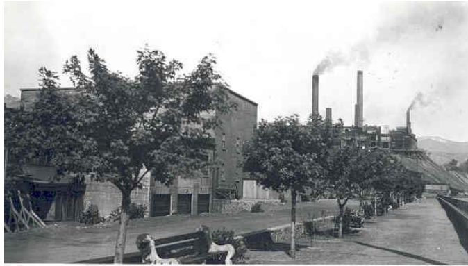
The Esplanade and river wall, 1950s, and the proposed site for the City's Esplanade centre.

budget prepared. Council hopes to make a decision to proceed with the Centre or not in the Fall.