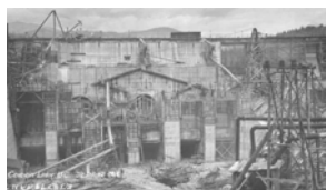
Construction of the Corra Linn Dam, September 12, 1931.

Last fall, FortisBC contracted with the Trail Historical Society to organize, rehouse and digitize its large archival collection that dates back to the days of the West Kootenay Power & Light Co. Thus far, the Society has tackled the large photograph and negative collection. This caption shows an sample image from the fonds.